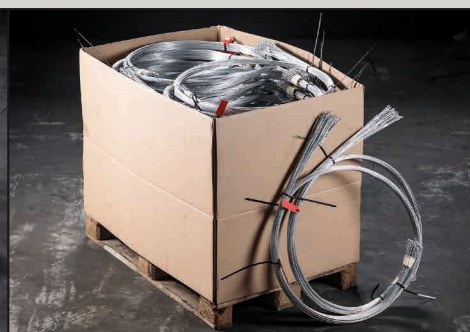
Rolled in box on pallet