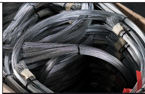
Cut and loops single looped - soft galvanized

Soft galvanized tying wires with two twisted loops, rolled up in bundles of 48 pieces = approx. 12 kg, max. 780 mm outer diameter, packed on EUR pallets.