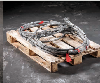
Rolled on EUR pallet