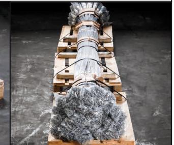
Small bundle to a large bundle on Euro pallet