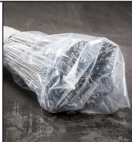
Small bundle with PVC bags

Small bundles tied with masking tape or cable ties, the ends of the small bundles are protected with PVC bags, packed in a large box on a EUR pallet and secured with steel straps or large bundles pressed with steel straps.