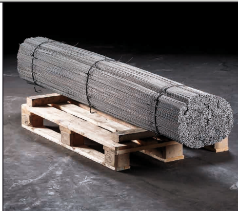
Small bundles packed into a large bundle and pressed with steel straps.

Small bundles tied with wires, large bundles pressed with steel straps.