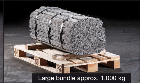
Large bundle approx. 1,000 kg