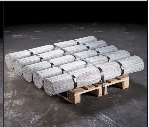
Large bundles pressed with steel straps.