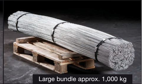
Large bundle approx. 1,000 kg