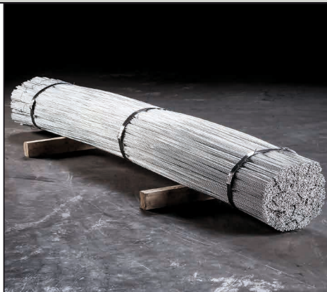
Large bundles on wooden blocks.

Small bundles tied with wires, large bundles pressed with steel straps.