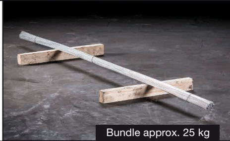
Bundle approx. 25 kg

Stainless steel, straightened and cut, available in small bundles of approximately 25 kg or large bundles of approximately 1,000 kg.