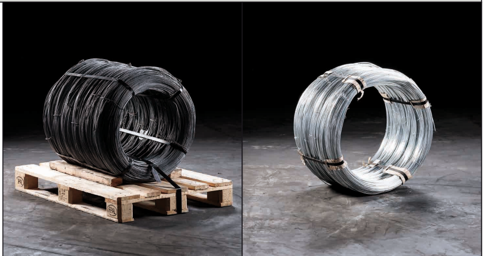
Large bundles of approx. 250-300 kg (0.8 – 1.60 mm)

Individual coils are tied with wire, large bundles are pressed together with steel straps