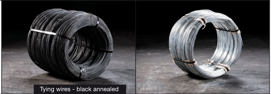
Tying wires - black annealed

Black annealed tying wires in coils of approx. 30/40 kg or 60/80 kg